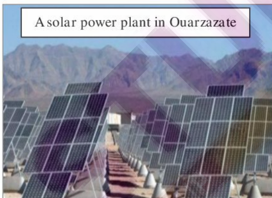
A solar power plant in Ouarzazate

[4] With a capacity of 580 megawatts, Noor power station is expected to occupy a space as big as the city of Rabat and provide electricity to 1 million homes. It is the fruit of the country's efforts in recent years to reduce dependence on imported energy. The first phase of the project, Noor 1, is already operating. This first station alone can produce a power equivalent to 160 megawatts and provide energy to 650,000 locals from sunrise until three hours after sunset. Noor 2 and Noor 3 will follow soon. Environmentally, once the three plants are operational, gas emissions should decrease significantly.